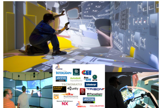
Figure 2: TechViz - handling any kind of hardware setup and 3D applications.

The open features of TechViz XL, handling any hardware and software, enable it to be integrated as easily and transparently as possible within a PLM workflow, providing a fast and intuitive tool for any kind of industries or institutes.